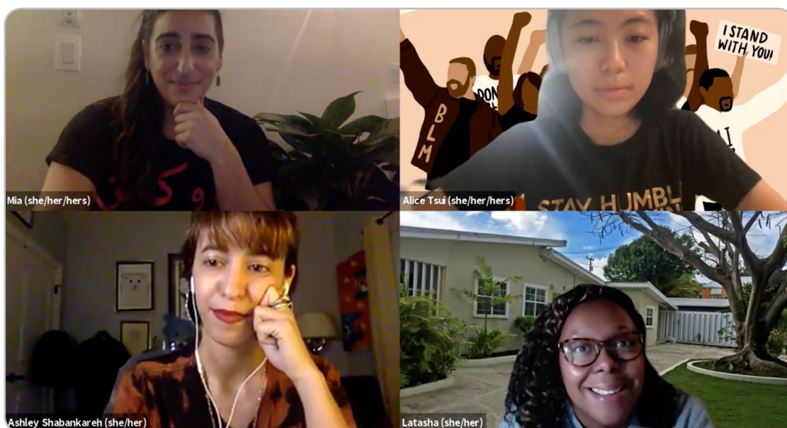
Teacher Expert Panel on Diversity and Inclusion.

In total we’ve provided 3,284 hours of community activities in this new virtual reality.