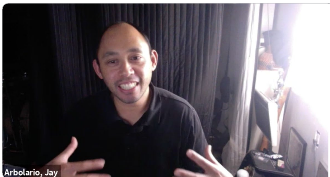
Teacher Expert Panel on Remote Learning