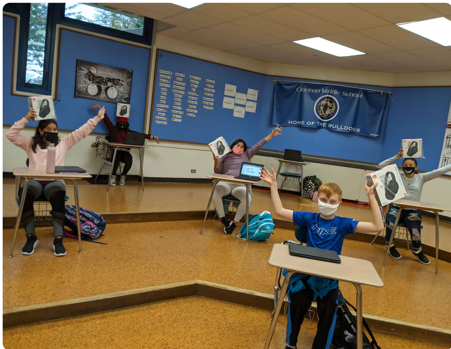
Cloonan Middle School students in Stamford, CT, with their new Headphones.

to digital curricular and professional learning resources for students and teachers.